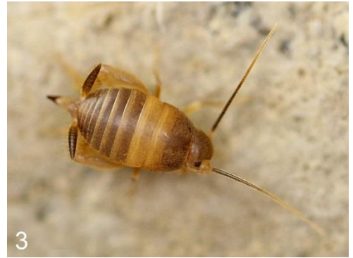
FIG. 3. Paratype of Myrmecophilus balcanicus sp. n. (female).

three dorsal spines in M. hirticaudus and M. termitophilus , which are positioned in the proximal, medial and distal parts of the basitarsus, where the spine is sometimes absent in the medial position, but the spines in the proximal and distal positions are always present); contrasting pale ochreous posterior half of the pronotum, the complete mesonotum, and the posterior margins of tergites 1–3 (contrasting pale ochreous posterior third of the pronotum; posterior third of the mesonotum and the posterior margins of tergites 1–3 pale ochreous in M. acervorum ; borders absent or faint in M. nonveilleri , M. hirticaudus and M. termitophilus ).