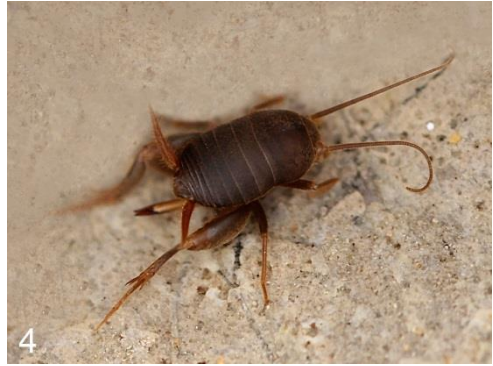
FIG. 4. Myrmecophilus hirticaudus (female), FYROM, Smrdliiva Voda, 26.07.2012.