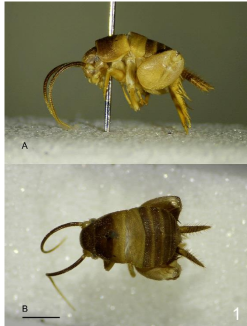
FIG. 1. Holotype of Myrmecophilus balcanicus sp. n. (male), lateral (A) and dorsal (B) view. Scale bar, 1 mm.

colour, dark ochreous, except the posterior half of the pronotum, the complete mesonotum and the posterior margins of tergites 1–3, which are contrasting pale ochreous. Pronotum and tergites densely covered with inclined, distant, relatively short and shiny hairs. Antennae are about as long as the body and dark ochreous, and the first two segments are pale ochreous. Palpi, ochreous. Eyes are black. Hind legs: hind femur, 1.4 times as long as wide; hind tibia with four inner subapical spurs, where the first and third spurs are shorter than the second and the fourth, and the third spur is slightly shorter than the first spur; hind tibia with three inner apical spurs.