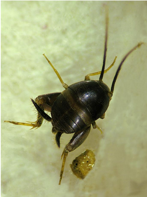
Fig. 1: Myrmecophilus baronii , male nymph. 14.10.2010, El-Fahs, Zaghouan, Tunisia.

1 adult female were found on April 10, 2010. At El-Fahs, Zaghouan (N 36°17'31", E 09°48'33", about 340 m a.s.l.), 1 adult male, 2 adult females, and 1 nymph female were found on 12 April 2010, and 1 adult male, 3 adult females, 1 nymph male (Fig. 1), and 3 nymph females were found on April 14, 2010. The habitat at Bir Bou Rebka was an open pine forest with interspersed shrub, and the habitat at El-Fahs was an uncultivated, stony area at the edge of a pine forest (Fig. 2).