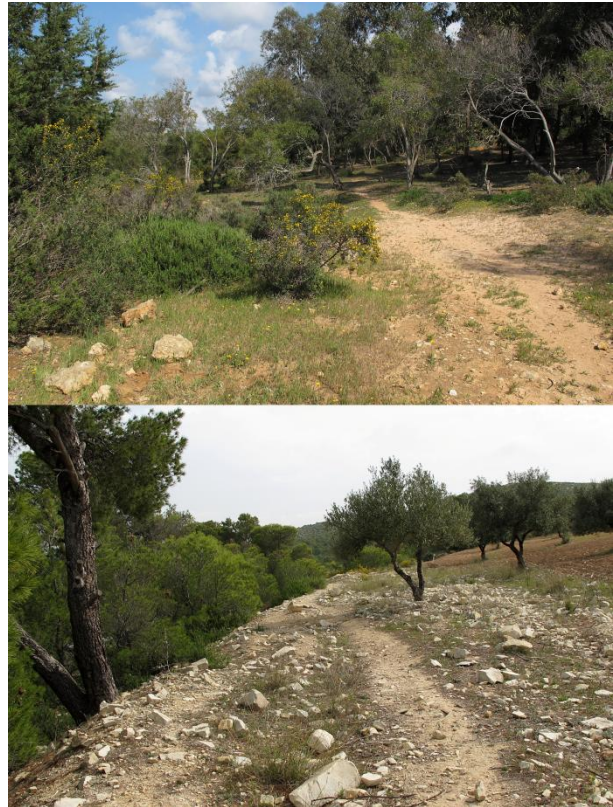
Fig. 2: Habitat of Myrmecophilus baronii in Tunisia. Top: Bir Bou Rebka, Nabeul, 10.04.2010; bottom: El-Fahs, Zaghouan, 12.10.2010.